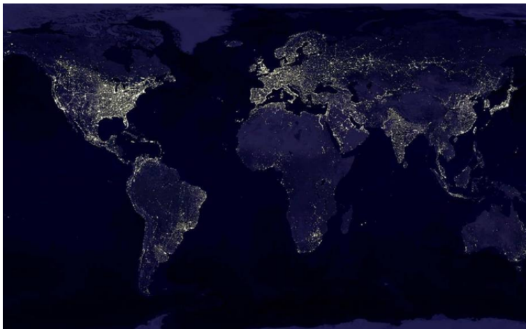
Public lighting on Earth

This talk should be accessible to graduate students.